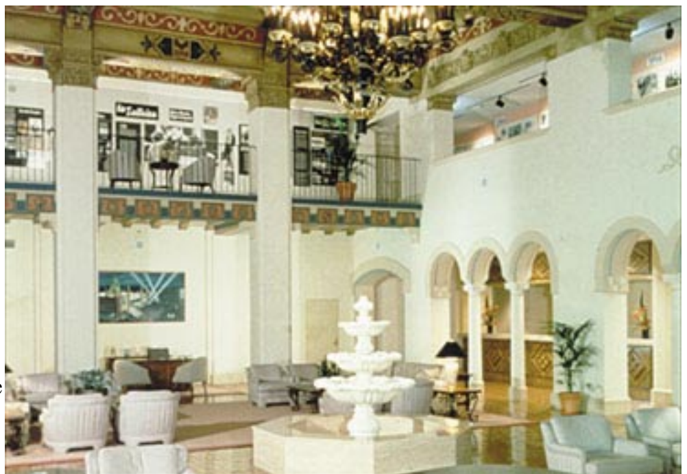
The Lobby of the Hollywood Roosevelt Hotel and site of first Oscars