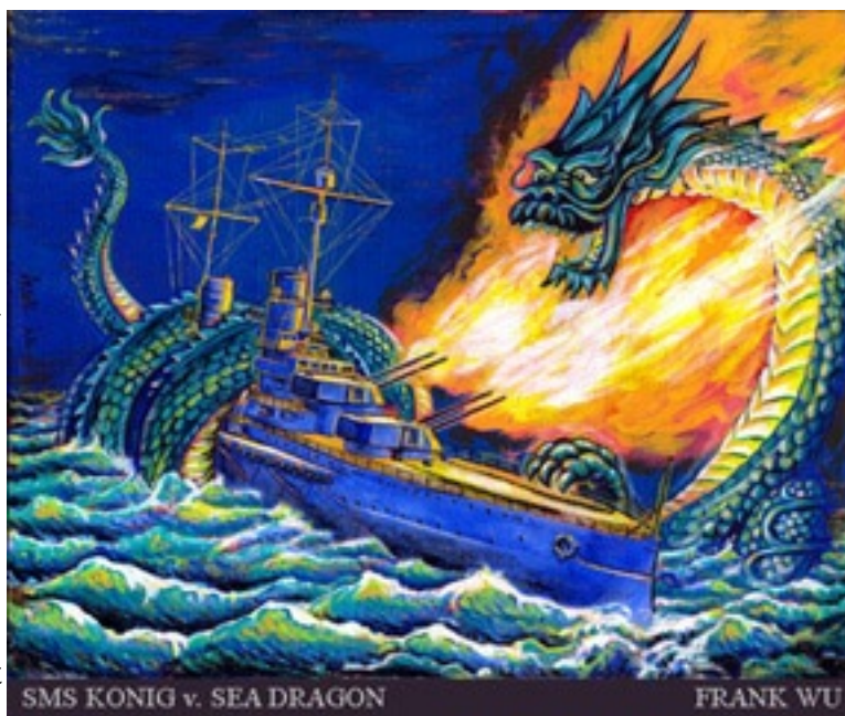
SMS KONIG v. SEA DRAGON

The other big thing I want to do involves art. The Licensing International Show occurs in New York every June. There people show off their projects, while toy-makers and folks from other companies appear to buy up projects. I've got two. One