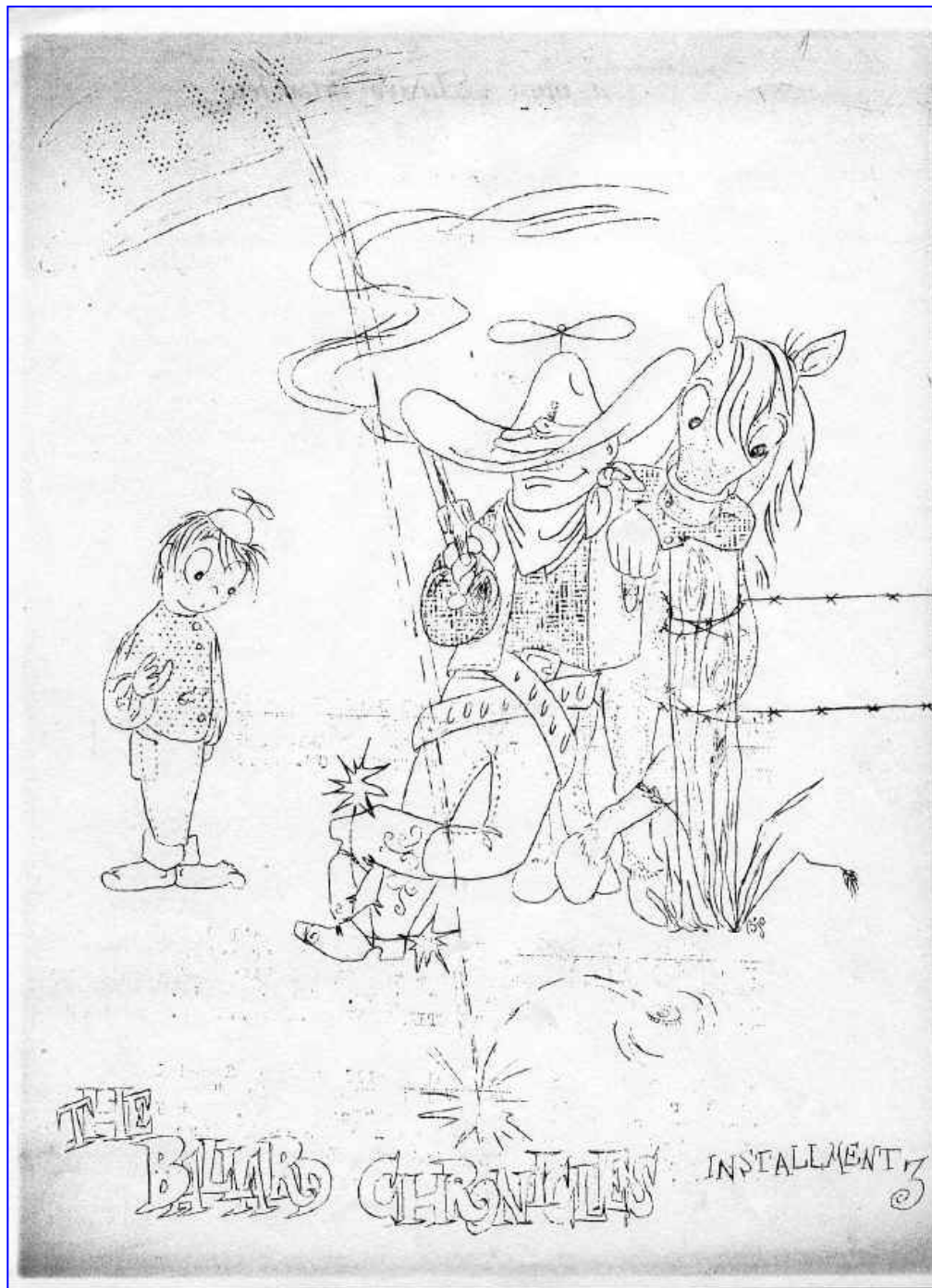
The Ballard Chronicles Installment 3 front cover by Bjo Trimble. Dated April 1960.

The third installment of "The Ballard Chronicles" was an American Western named The Musquite Kid Rides Again . It was included with the 51st SAPS mailing in April 1960.