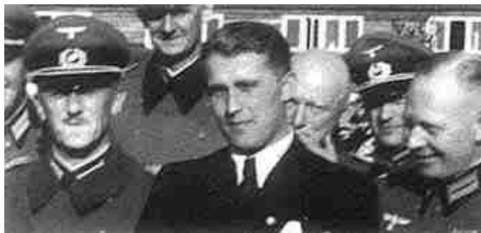
Werner Von Braun and some of his fellow Nazis at the launch site of his V-2 "Buzz Bombs," Peenemunde, 1943.

In Germany in 1929 science fiction fan and space nut, Werner Von Braun, joined the German Rocket Society. He was already well underway with his private journey to the stars, and I was only birthing on Sol III; there was no way I could catch up.