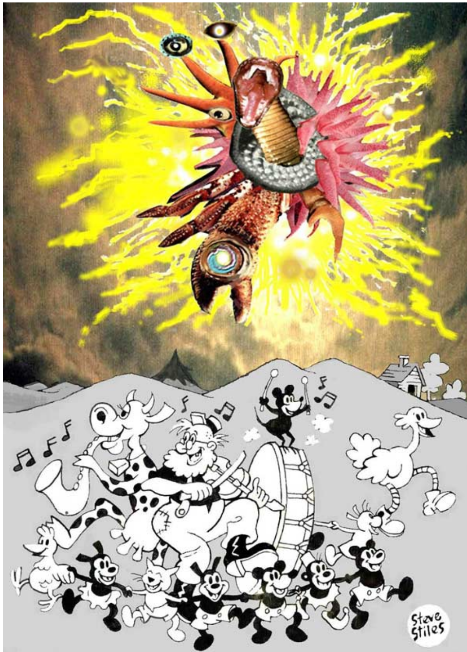
A Great Old One invades Tralala Land

—e*I*35— (Vol. 6 No. 6) December 2007, is published and © 2007 by Earl Kemp. All rights reserved. It is produced and distributed bi-monthly through efanzines.com by Bill Burns in an e-edition only.