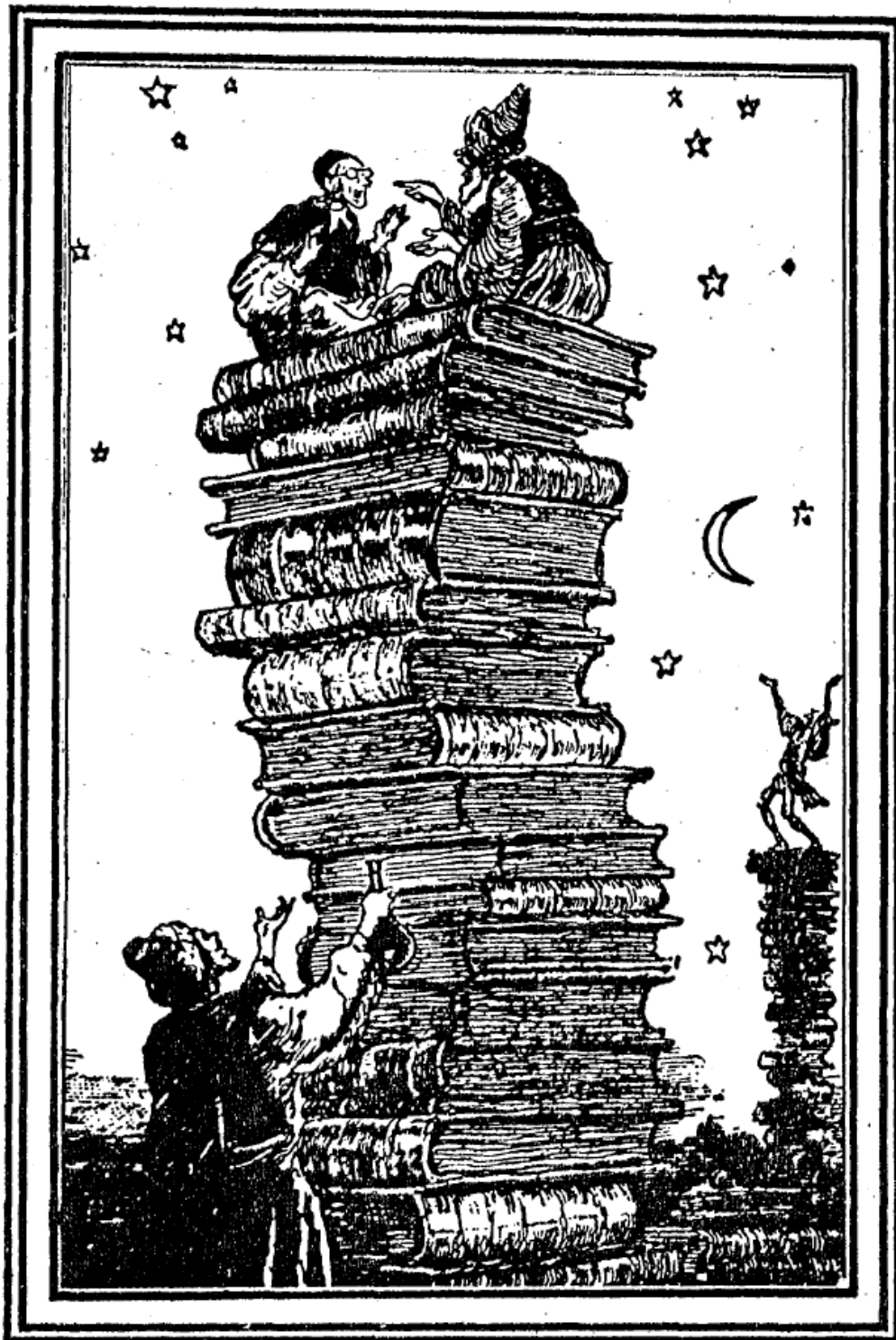
Mumblings from Munchkinland -- the only West Australian fanzine published in India!