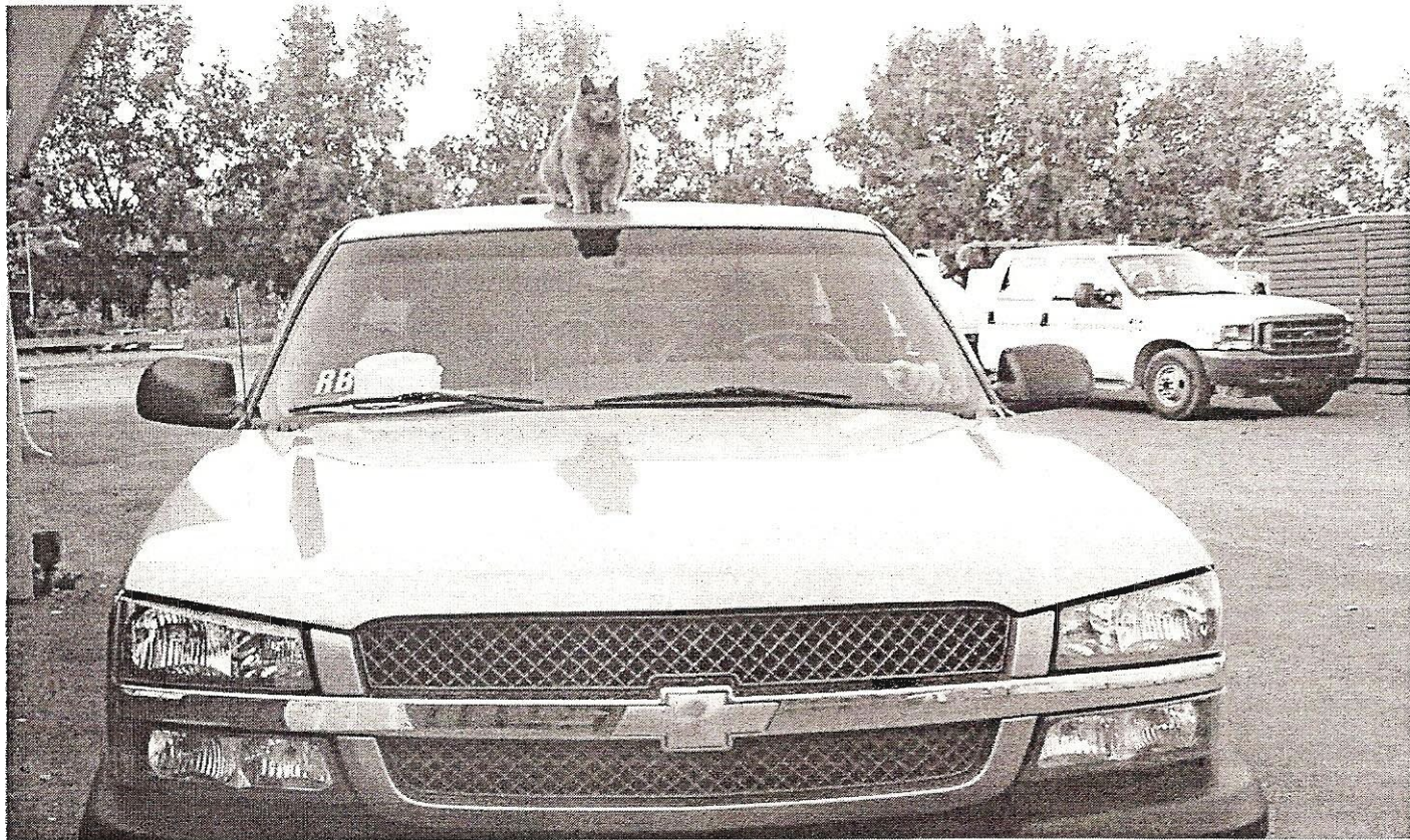
Walter the cat sits on the roof of a Parks Dept. pickup truck.