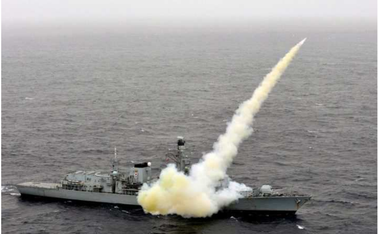
HMS Montrose testing a Harpoon missile, which has a range of up to 80 miles

Naval sources said the decision was “like Nelson deciding to get rid of his cannons and go back to muskets” and one senior former officer said warships would “no longer be able to go toe-to-toe with the Chinese or Russians”.