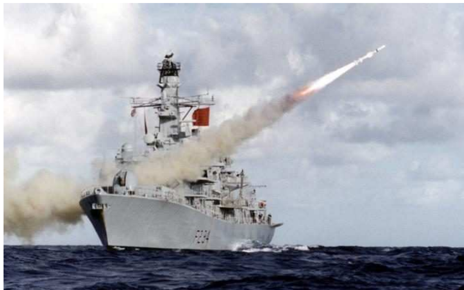
HMS Iron Duke firing a Harpoon missile

http://www.telegraph.co.uk/news/2016/11/15/royal-navy-to-lose-anti-ship-missiles-and-be-left-only-with-guns/