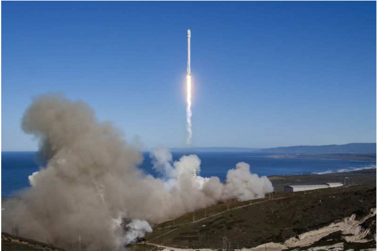
A Falcon 9 rocket launches from Vandenberg Air Force Base in California in January, 2017.

Tax Board, told the newspaper that the rules are designed to mirror the ways taxes are levied on terrestrial transportation and logistics firms operating in California, like trucking or train companies.