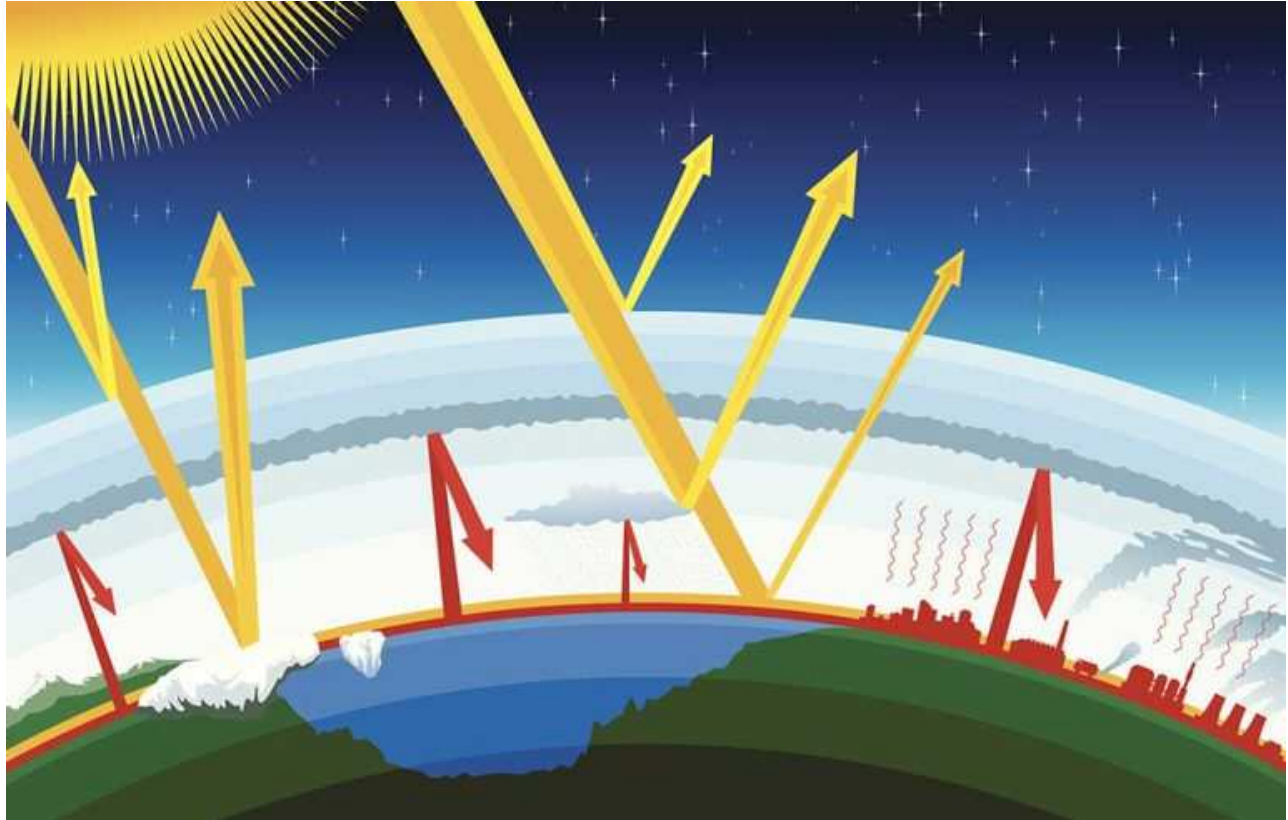
Ignorance, Intolerance & Violence Behind Climate

https://www.ammoland.com/2017/05/ignorance-intolerance-violence/#ixzz4g7W26UcY