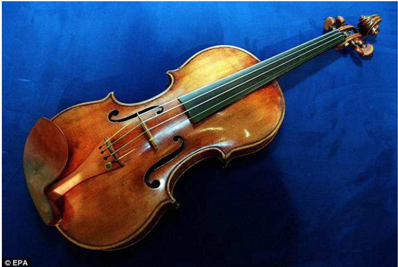
A 300-year-old violin by Antonio Stradivari is seen at the Christie's auction house in New York 01 May 2000. New research suggests new violins that cost a fraction of the price sound better than rare Stradivari instruments in a concert hall environment

But new violins that cost a fraction of the price sound better than rare Stradivari instruments in a concert hall environment, according to research.