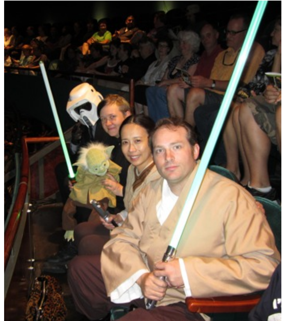
Cosplayers at One Man Star Wars

A group of friends and I went to see the show on the last day of his limited-run performance. We all decided to dress in costume complete with props. There were several other people in the audience wearing costumes including a few children and others wearing Star Wars t-shirts. The bar inside the theater building was even renamed Mos Eisley Cantina for the run of the show. Psycho Donuts nearby also got into the spirit of the show by advertising their Wookiee donuts, which decided to partake of. The verdict on the Chewie Dough and Wookiee Balls: delicious).