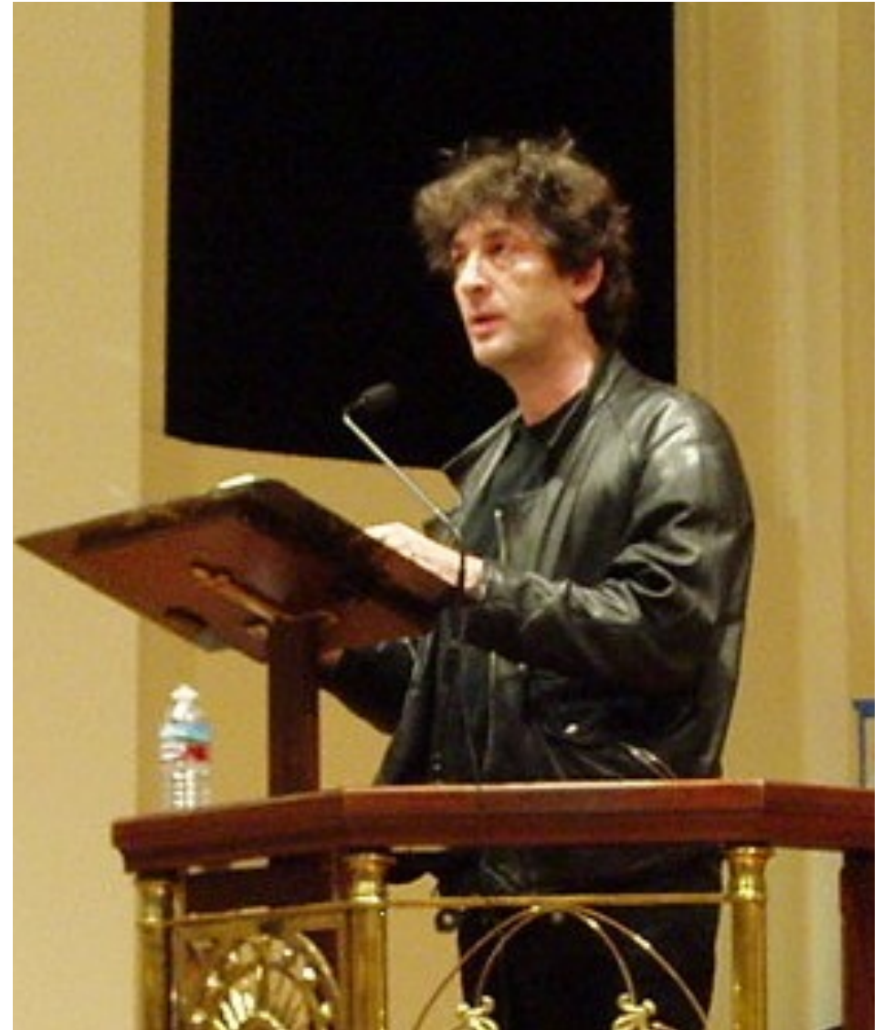
Neil Gaiman at First Congregational Church in Berkeley in 2005

So I got the ticket and headed to Berkeley last June 27, crossing a tunnel for an event! If you're a San Franciscan, you know how momentous this is. Not just that, it was on a Monday. I had planned to go to Death Guild with some friends, so I had to plan my outfit accordingly. Fortunately, casual Goth looks pretty much like Gaiman cosplay so that worked out fine in a creepy fan sort of way.