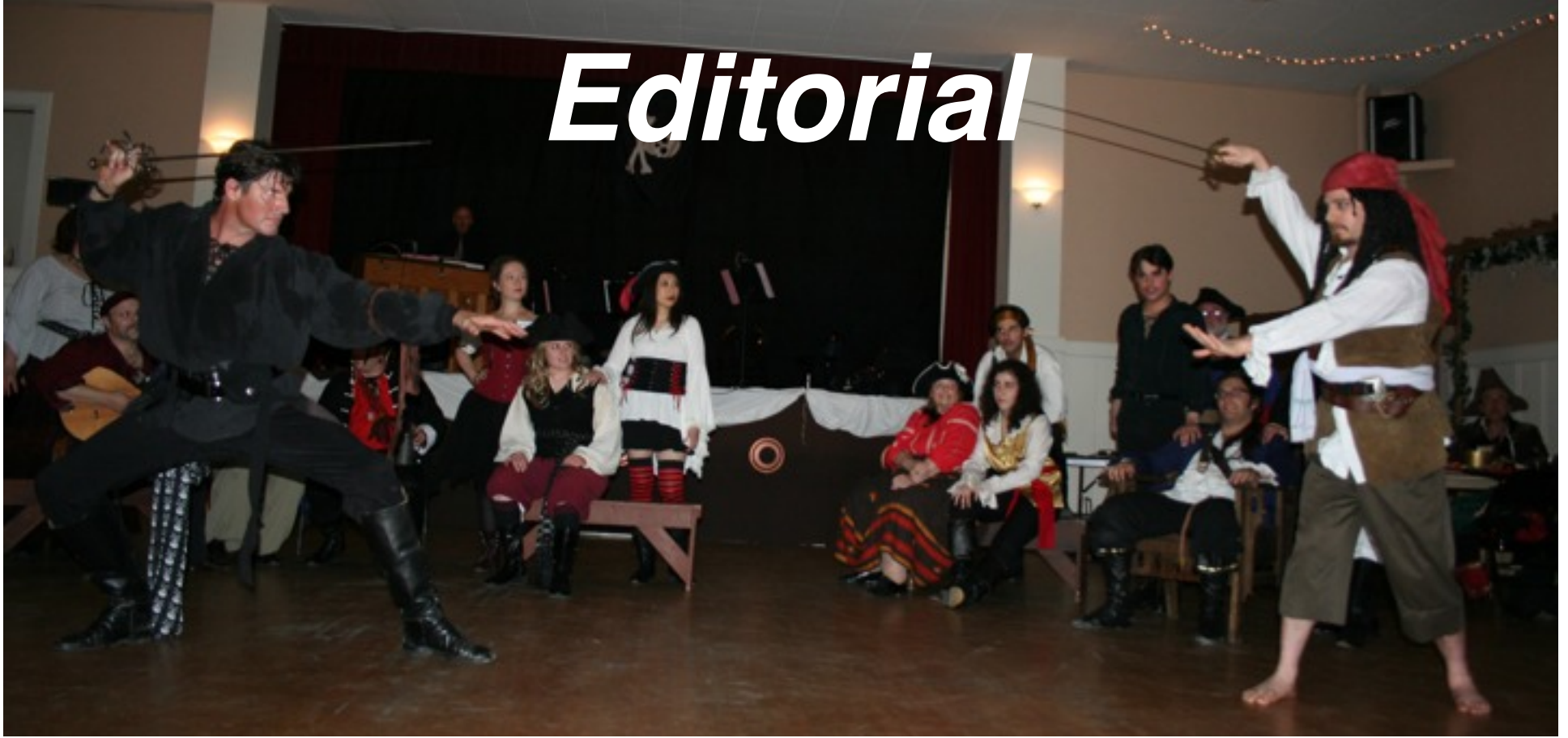
Sir Christopher Lee and Captain Jack Sparrow Dueling