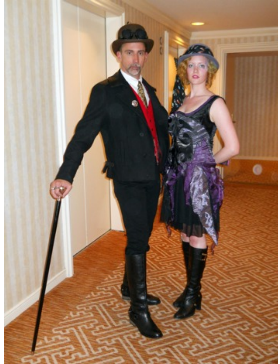
Steampunk Party Goers