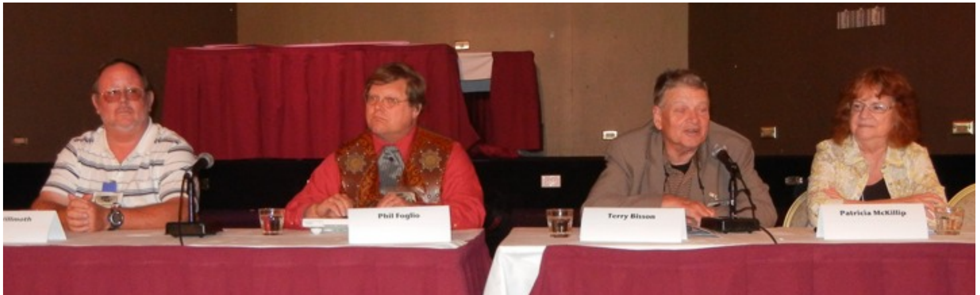
SFinSF Readings at Westercon

After the meeting, a small group of us headed down the street to a wonderful little place called Single Barrel, which is a speakeasy-style bar with amazing handcrafted cocktails. I