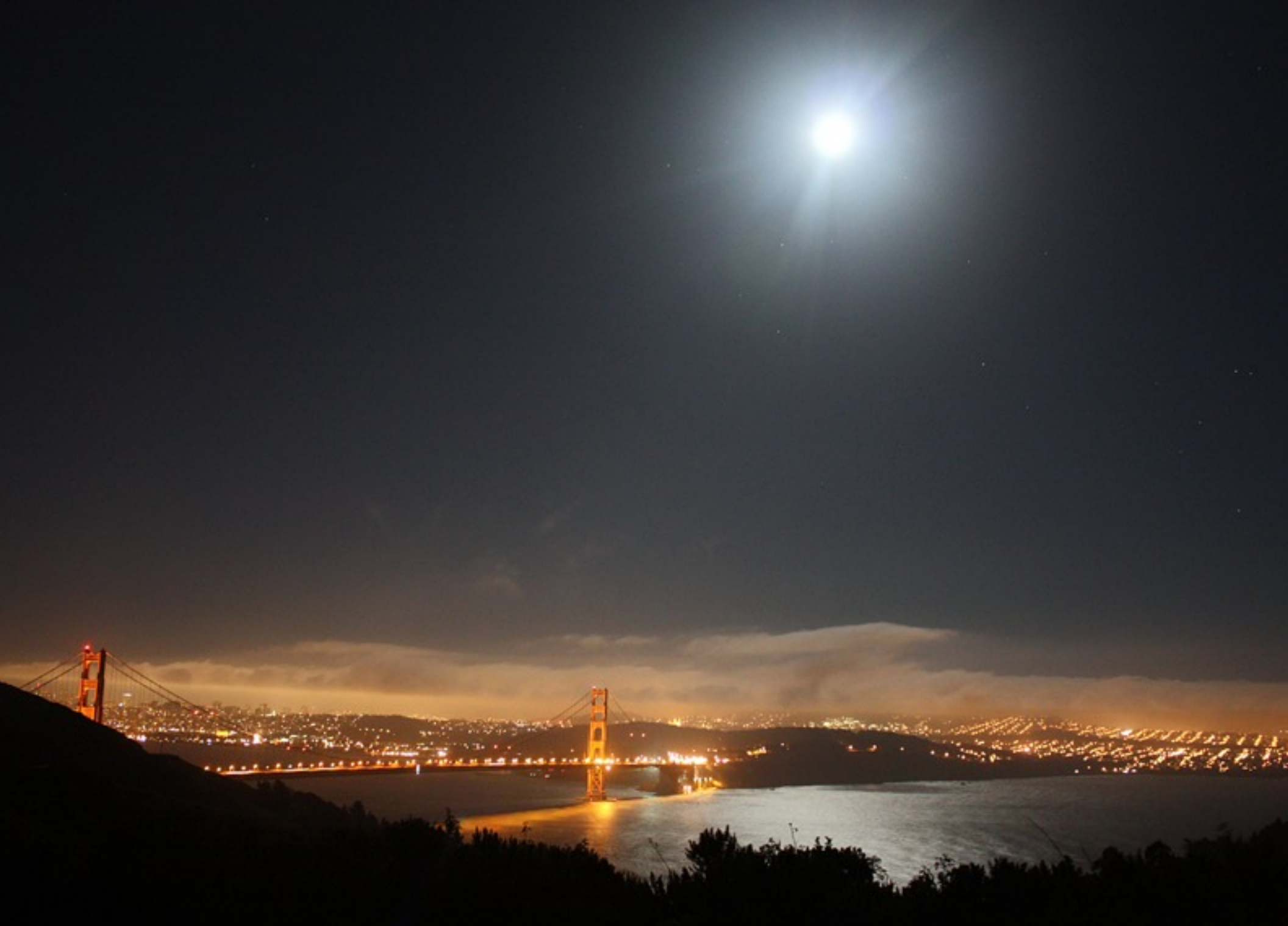
Moon over San Francisco