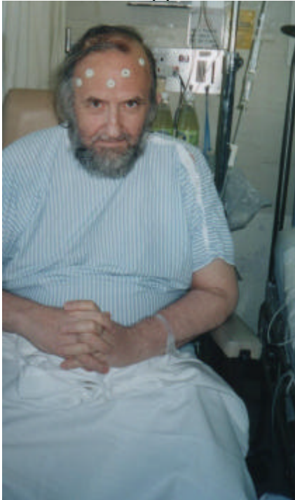
Are you sure that these dots are aligned with what's left of my brain?