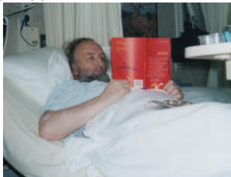
While Habermas's views on a European constitution seem sound, he doesn't mention the Basques