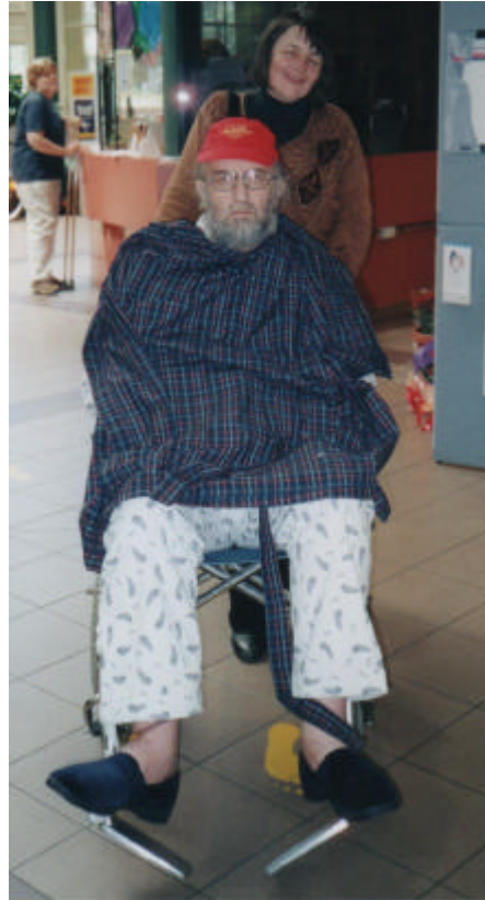
So there is a world outside hospital after all!