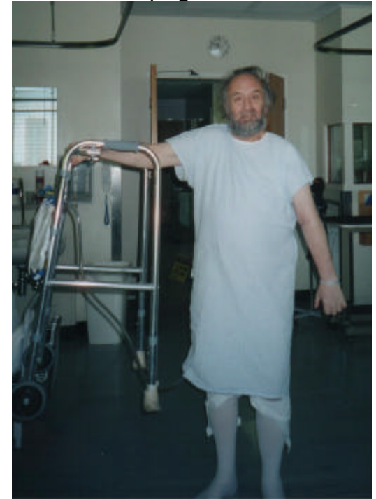
Of course it isn't the conventional way to use a walking frame, but it works for me...