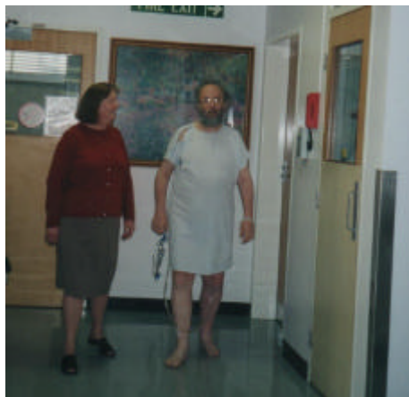
And I learned to walk in these corridors: 20 laps is one kilometre..