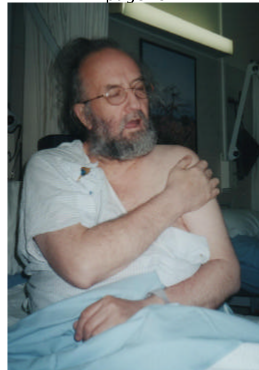
Stop the philosophizing, just pass me the goddamn hemlock!