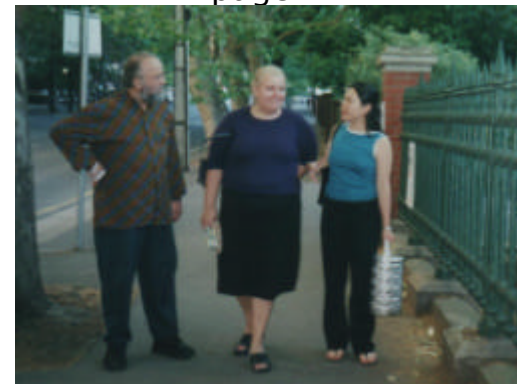
I don't mind escorting you two back to your car, but how far did you say it was?