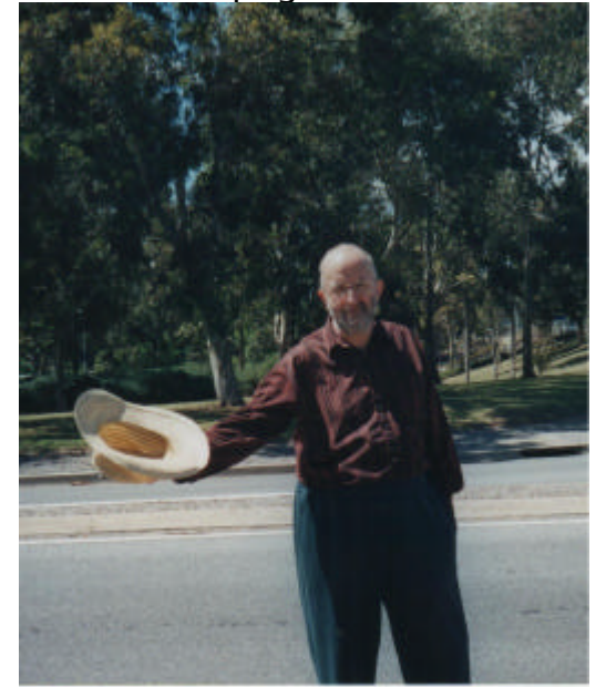
That's all, folks!