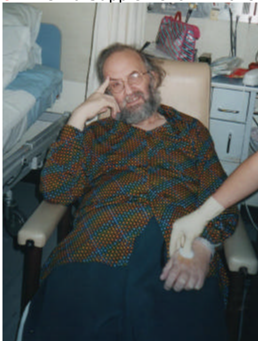
Hey, infectious yes, but it's surely not that bad...