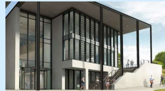
Architect's impression of the new library extension

books or solve database problems, then you find you've run out of time before your next helpdesk shift or library training session. If only I were one of those human being designed not to need food halfway through the day!