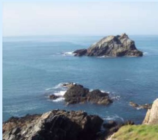
Cornwall today – sunshine and views from Pentire Head over Crantock. 1 st October 2011